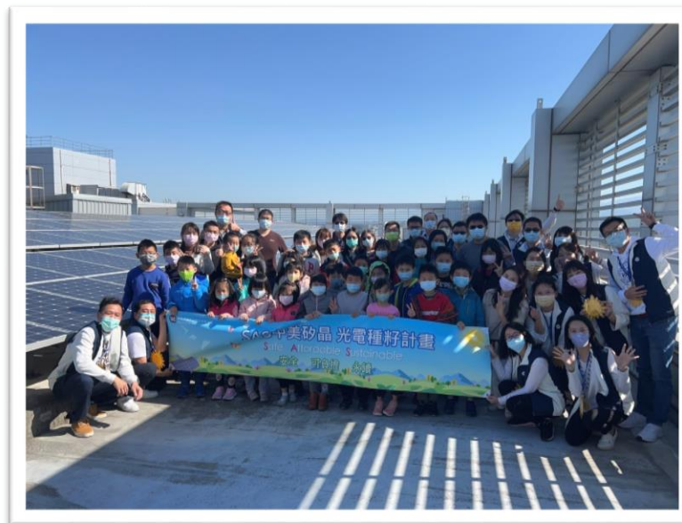
Solar PV Camp 2021